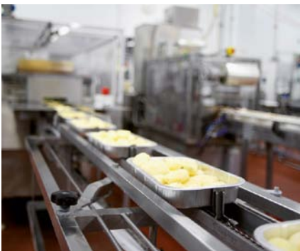
Conveyor belts and chain conveyors are an ideal application for the FR-D700 SC.