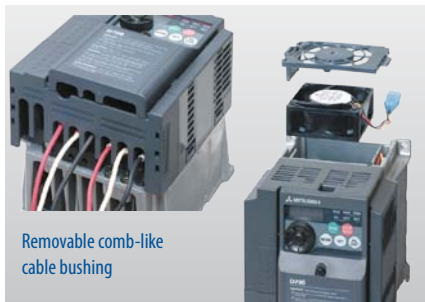
Removable comb-like cable bushing

The fans are designed as compact units that can be replaced in less than 10 seconds for cleaning or in the event of failure.